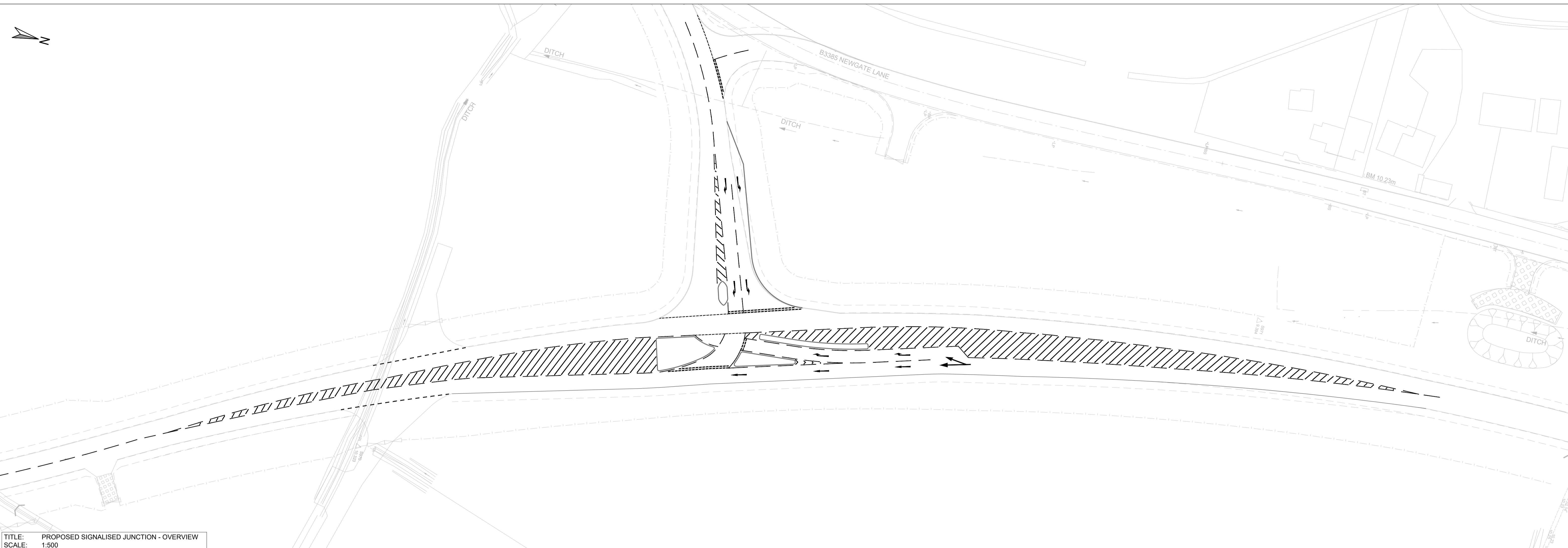
TITLE: PROPOSED SIGNALISED JUNCTION - OVERVIEW SCALE: 1:500